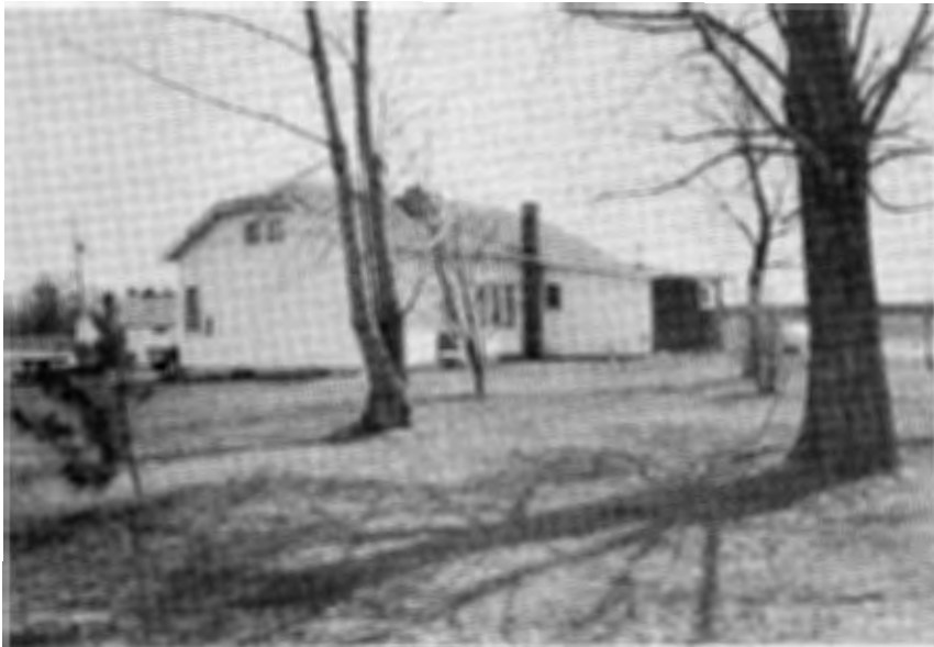
This is the original house and tavern built in 1934, showing some exterior changes that have taken place since 1950.