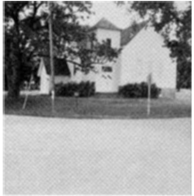
West side view