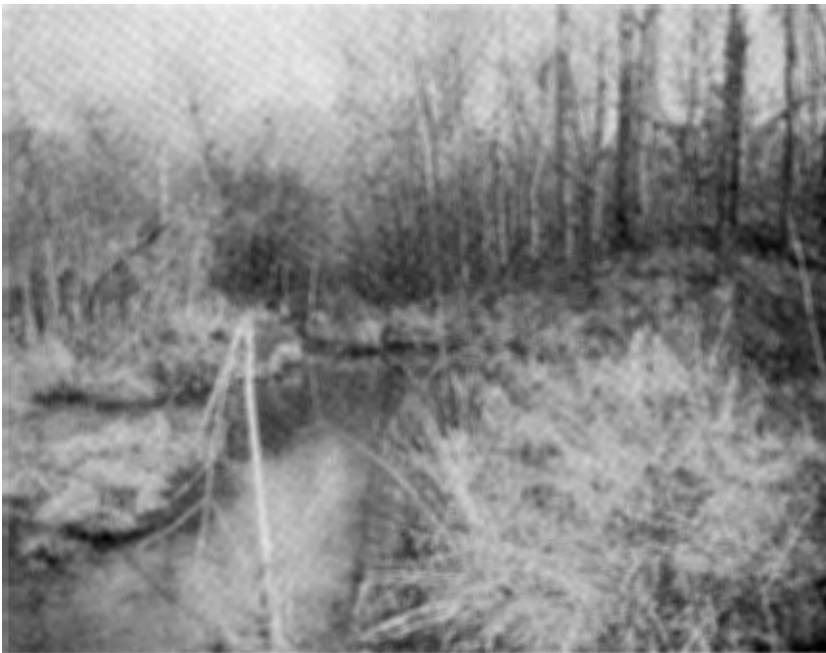
The first mill site.

This old roadway is still visible through the ferns and underbrush even after these many years.