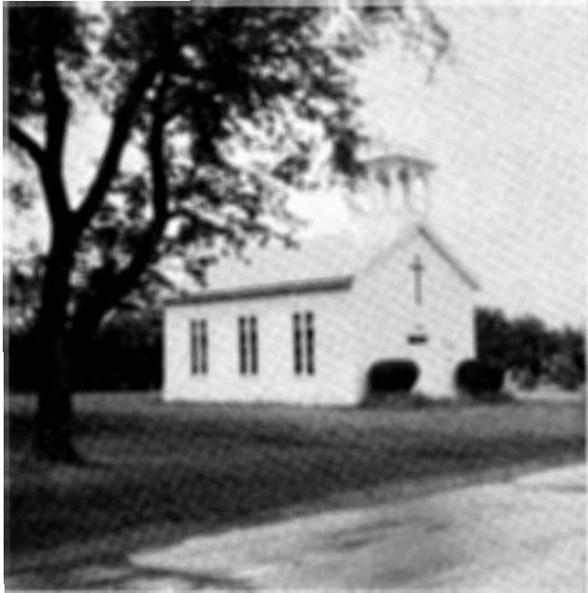
BLAINE COMMUNITY CHURCH

A cement floor will be put in the basement of the new Church this week.