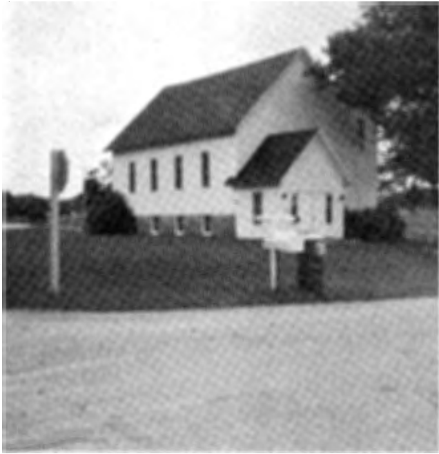
North side view