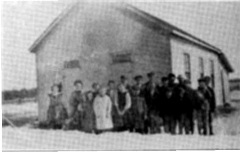
An old picture, date unknown and names unknown.