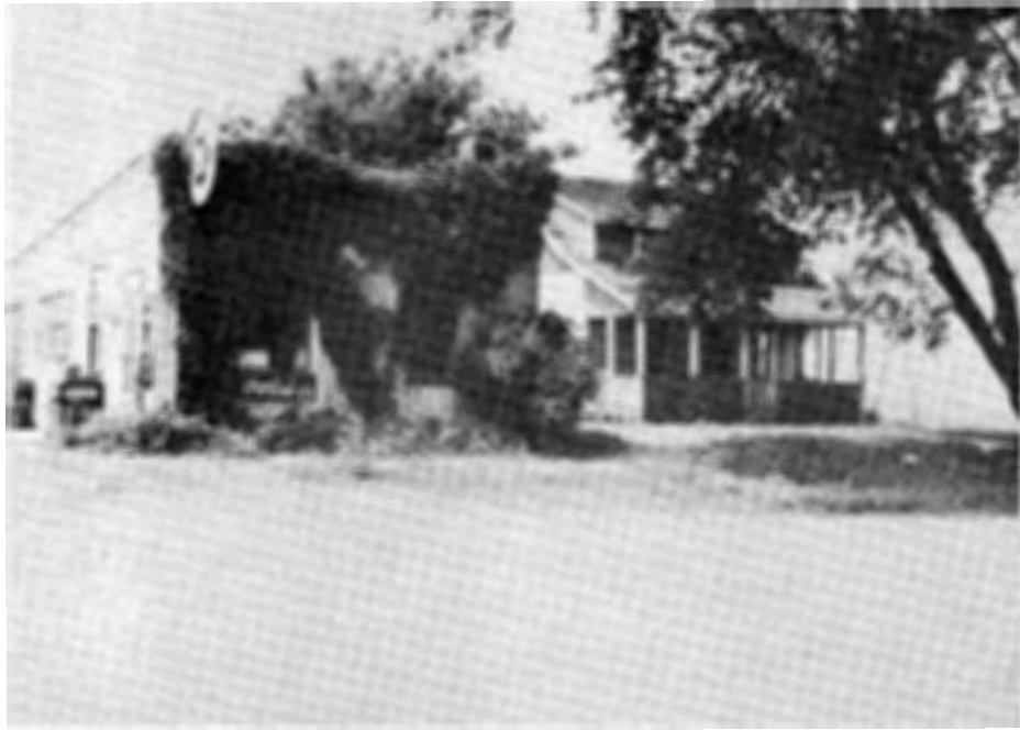
The Blaine Garage and house, as it looked prior to 1970 when they were purchased by Henning and Arlene N. Gneist.