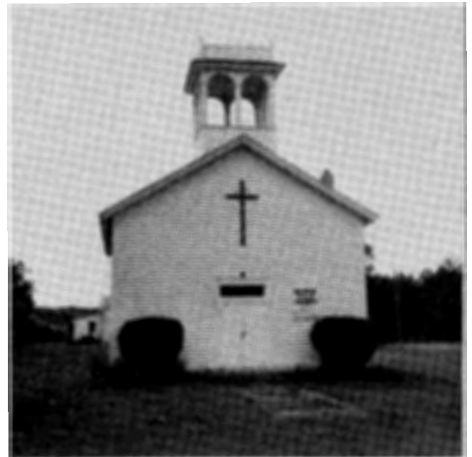
Front (east) view Blaine Community Church

Side view from the southwest. Taken in August, 1982, Blaine Community Church. Built in 1875.